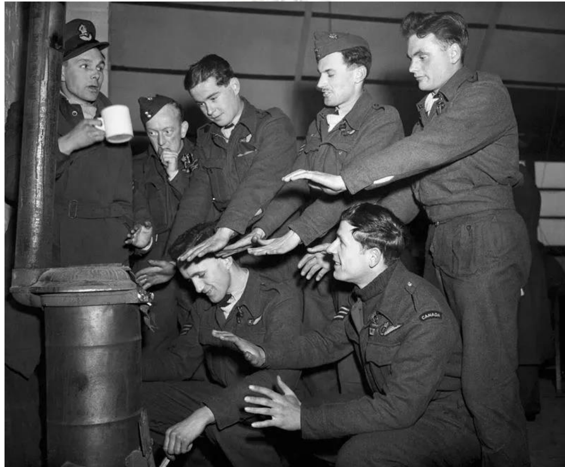
The crew of Lancaster "C for Charlie" of No 44 Squadron try to warm themselves in their Nissen hut quarters at Dunholme Lodge, after returning from a raid on Stuttgart, 2 March 1944.